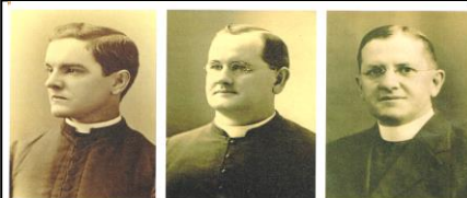
Fr. Michael McGivney Fr. Patrick McGivney Fr. John McGivney