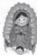
Virgen María purísima

Para más información llame (512) 269-7909 o (254) 627-9362.